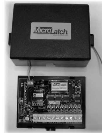
Standard Version ( Indoor ) REC-20