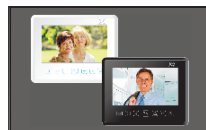
Black / White Color